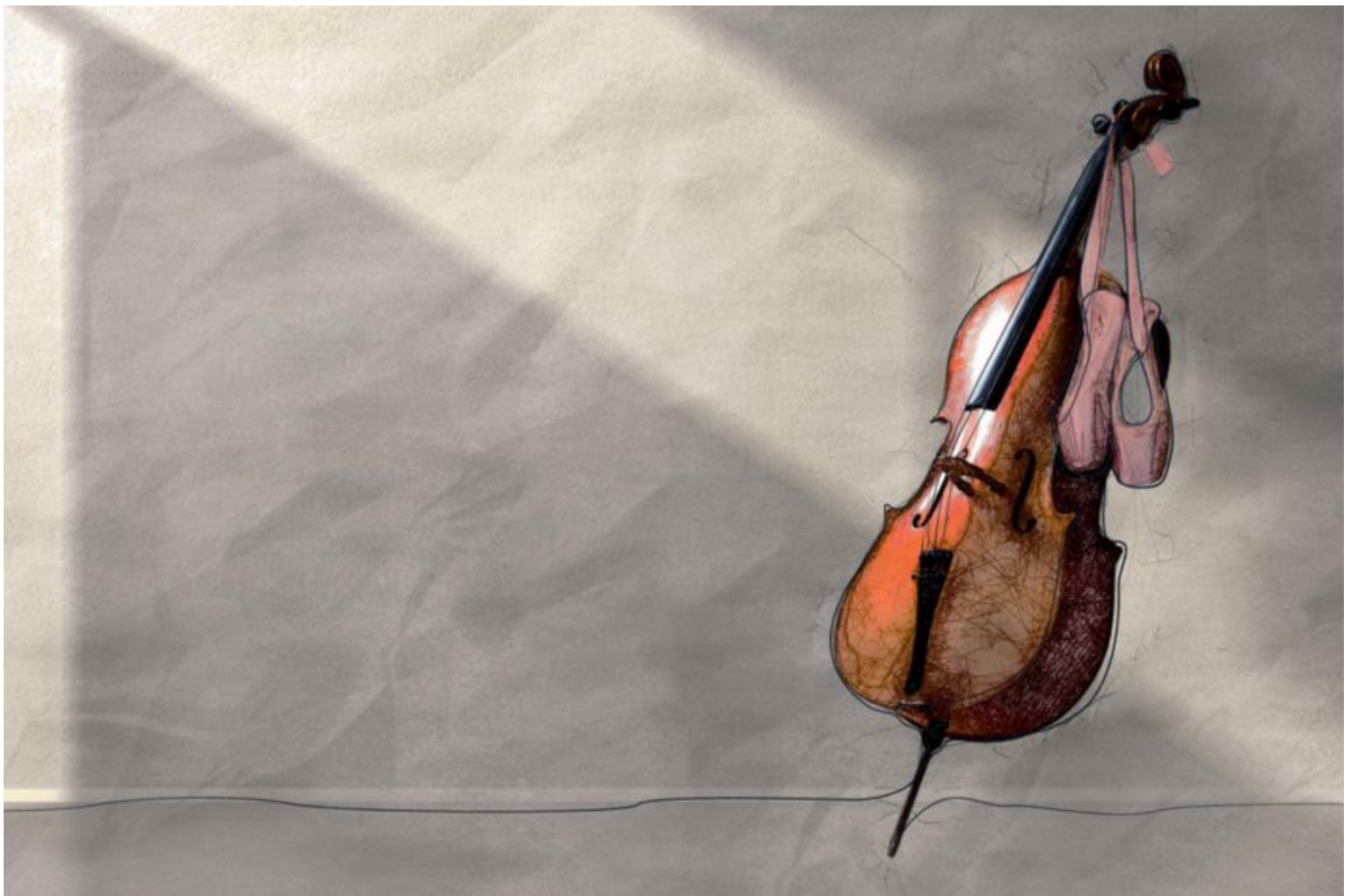
This is the first time the decades-old companies are performing together on stage for a commissioned project.